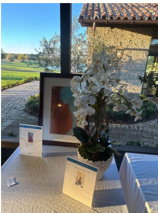
Silent Auction - Beautiful flowers