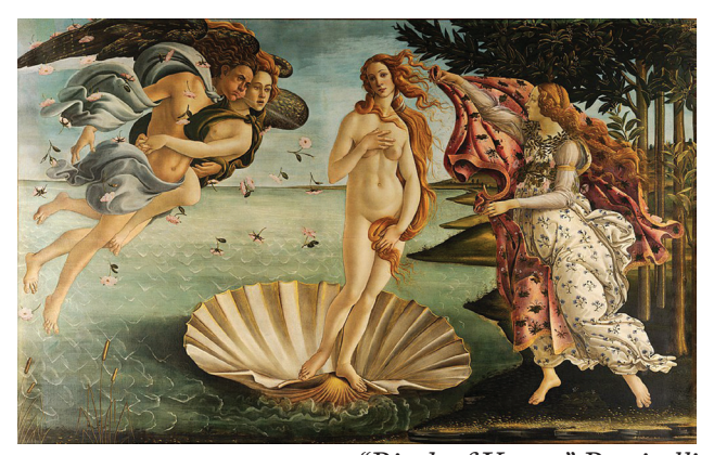
"Birth of Venus," Botticelli