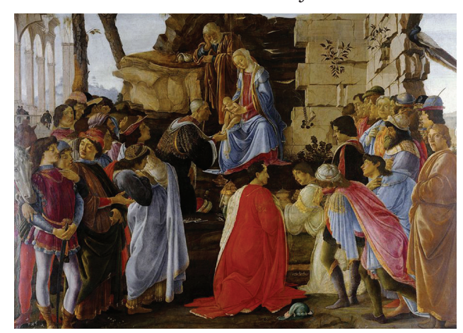
"Adoration of the Magi," Botticelli